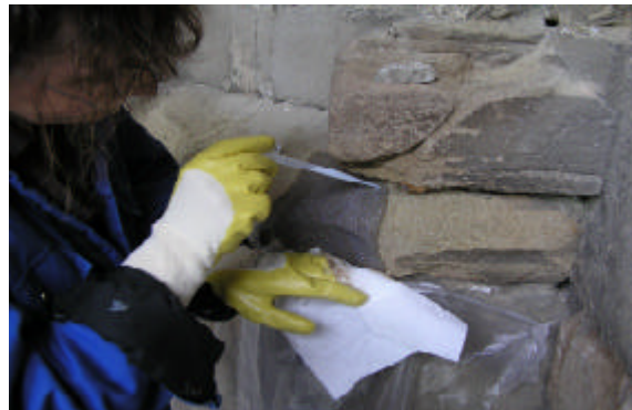
Treatment of highly porous sandstone with CaLoSiL ®

The combination of CaLoSiL ® with silicic acid esters allows the consolidation of materials, which can not be treated with silicic acid esters, normally. For examples, consolidation of stones containing carbonates can be realized favourably by combining a treatment with CaLoSiL ® followed by an application of tetra ethoxy silane. Another possibility is using homogeneous mixtures of CaLoSiL ® and tetra ethoxy silane. These can be adjusted to pre-defined reaction times. Also in this case, careful adaptation of the product and the treatment process to the properties of the stone is important.