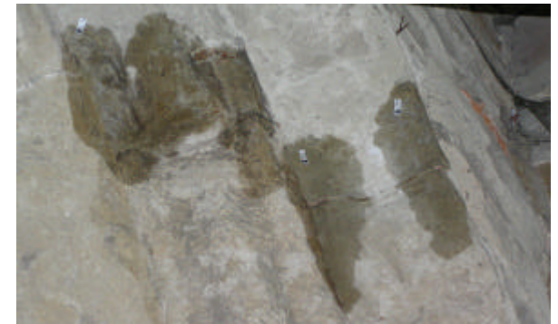
Test field treated with silicic acid ester after application of CaLoSiL ® in a first step.

We supply special silicic acid esters with compositions aligned to CaLoSiL ® .